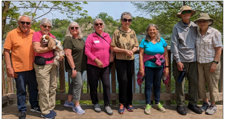
A beautiful May W.H.E.T. walk at Hidden Lake Park in Brookfield ended with frozen custard.

On Thursday, July 20, we'll explore a hidden gem, meeting at 1:30 p.m. at Stigler Nature Preserve, 17400 W. Liberty Lane, New Berlin. Liberty Lane is off Calhoun Road between Lincoln and Cleveland avenues. There is a small parking lot, but you can also park on the street.