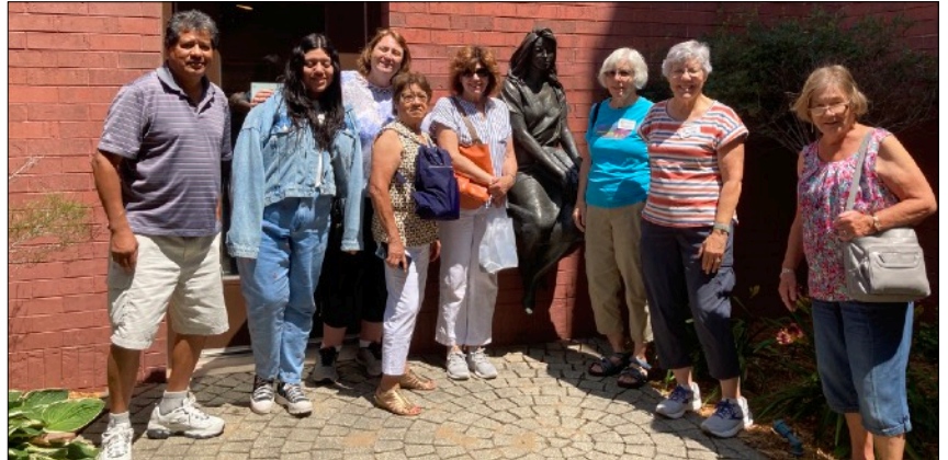
Manitowoc Day featured a Rahr-West Art Museum visit.

Check my.friendshipforce.org frequently for other travel opportunities.