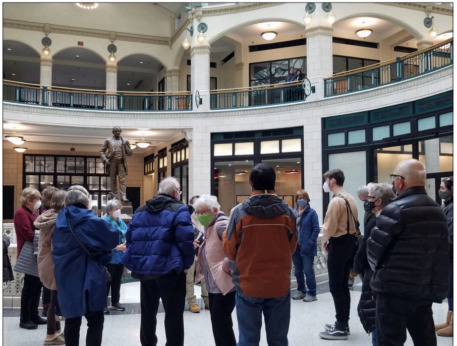
FFGM members gathered January 29 at the Plankington Arcade for a Skywauke Historic Milwaukee Tour.

Any FFGM member may participate in any book club meeting even if you have not read or completed reading the selected book.