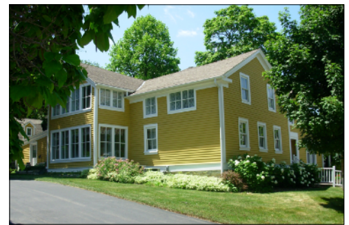
Clark House Museum in Pewaukee

Watch your email and the next newsletter for details.